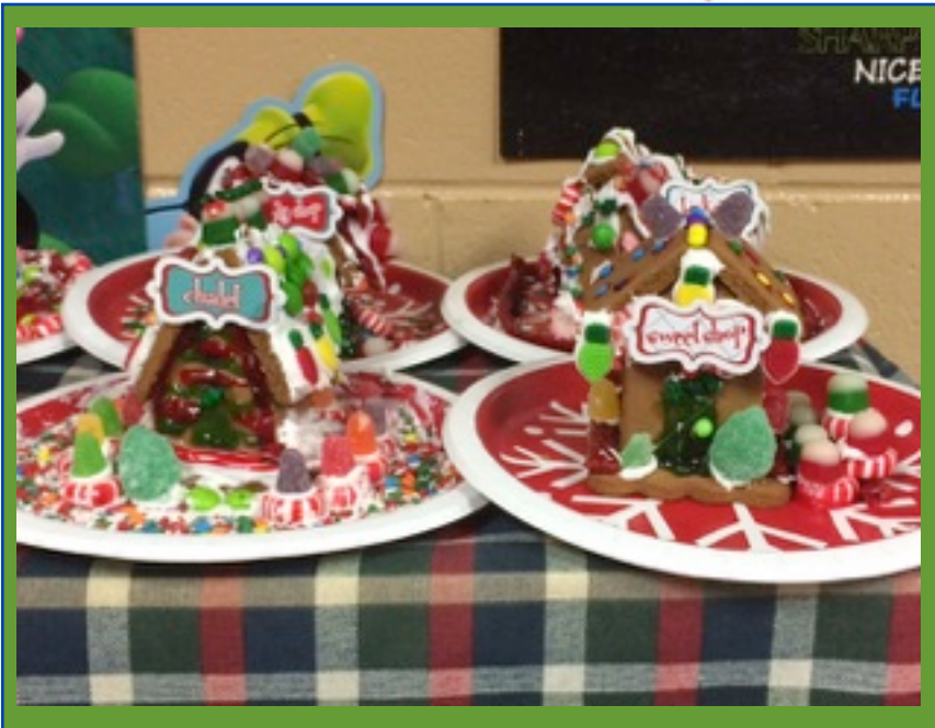
Fourth grade creations!

The great thing in this world is not so much where you stand, as in what direction you are moving.